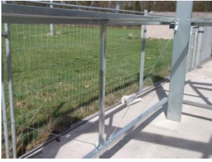
Anti sag system as required by BS5950