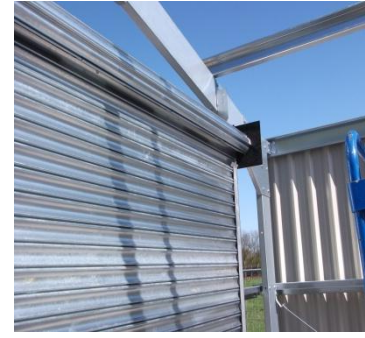
Industrial Specification Roller shutter door c/w hand chain as standard