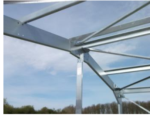
All our buildings are fully braced to BS5950 using rigid bolted components.