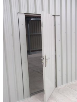
Steel security PA Door 10 point locking system, powder coated