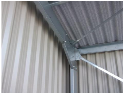
Anti condensation lining on all single skin roof panels