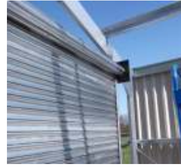
Industrial Specification Roller shutter door c/w hand chain as standard