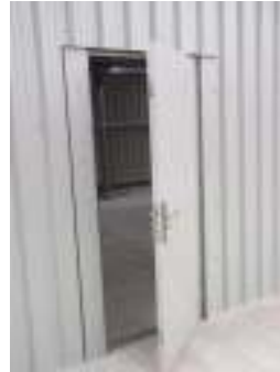
Steel security PA Door 10 point locking system, powder coated