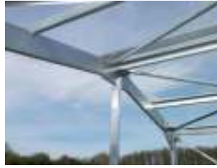
All our buildings are fully braced to BS5950 using rigid bolted components.