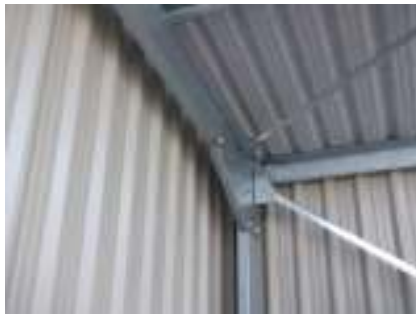
Anti condensation lining on all single skin roof panels