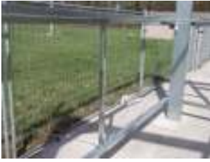
Anti sag system as required by BS5950