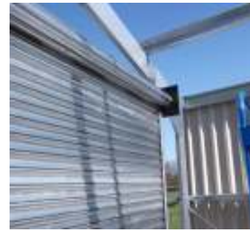
Industrial Specification Roller shutter door c/w hand chain as standard